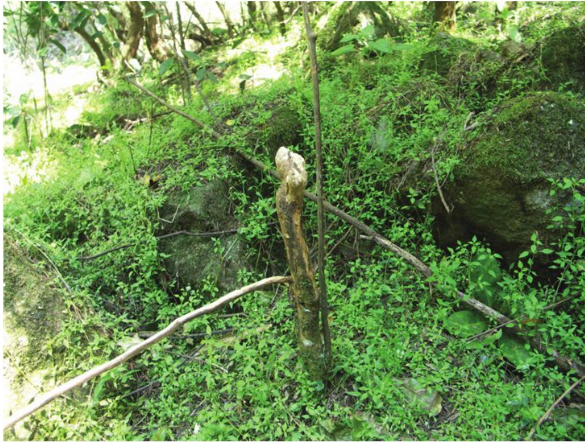
Fig. 4. Mortality of both a mature Yellow-wood stem (now a stump) and resprouting stem (horizontal stem), caused by antler rubbing.

Despite the high levels of mortality that are occurring, Yellow-wood trees often re-sprout from stems below antler rubs and/or sucker from roots. Yellow-wood therefore has the potential to persist in areas subjected to high levels of adult stem mortality; however, the regeneration is often subjected to antler rubbing once it reaches suitable size (Fig. 4), so the plant has a limited capacity to reach maturity. Therefore, the short-term ability for Yellow-wood to persist at sites with continued antler rubbing is high, but the long-term survival of Yellow-wood is in doubt given that its primary regenerative mechanism for the renewal of the stand and individual is dramatically affected.