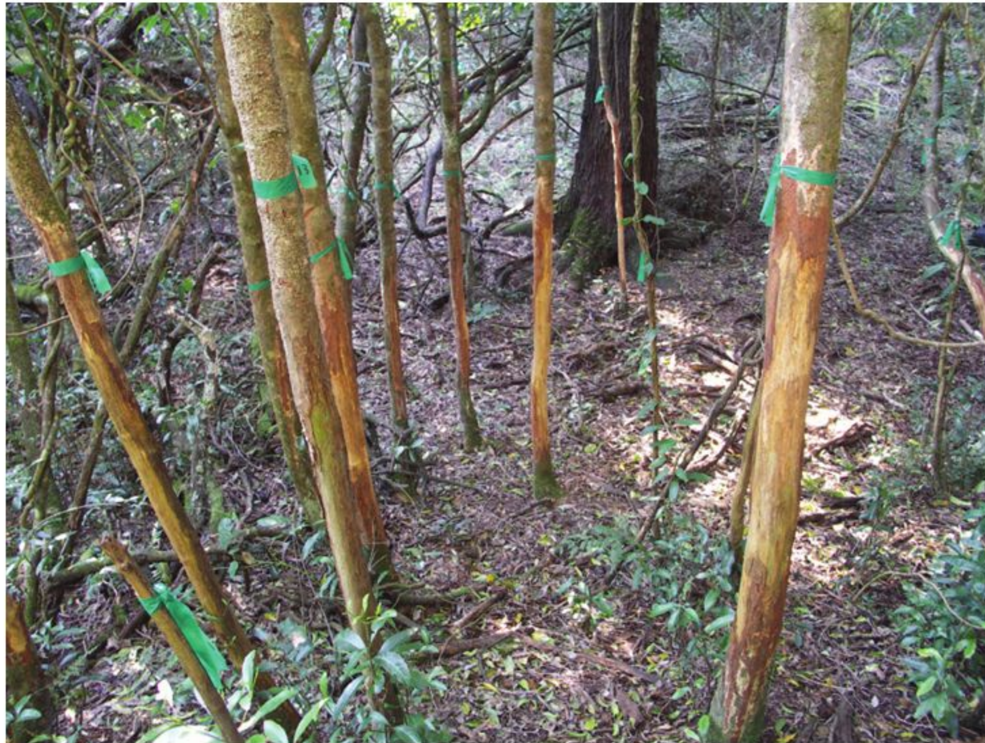
Fig. 1. A stand of 17 Yellow-wood, all severely antler rubbed by Sambar.

Between 2002 and 2008, most known stands of Warm Temperate Rainforest (based on Ecological Vegetation Class maps available on-line from the Department of Sustainability and Environment http://www.dse.vic.gov.au/about-dse/interactive-maps ) were surveyed from foothill and coastal forests (below 400 m elevation) between the Mitchell River in the west and the Snowy River in the east (excluding the Snowy River catchment, but including Cabbage Tree Creek approximately 10 km east of the Snowy River). The survey area incorporated most of the known populations of Yellow-wood in Victoria (except for the Snowy River